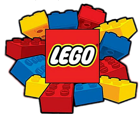
LEGO® is a registered trademark of the LEGO® Group of companies which does not sponsor, authorize, or endorse these camps.

Our LEGO camp explores science, technology, architecture, engineering, and art concepts using LEGO® bricks for pupils aged 7-14. The camp will fire up your child's imagination and spark creativity in the form of inspired play, building one of our themed LEGO creations coupled with our magical delivery. Our curriculum will provide your child with an opportunity to design and build lots of different LEGO® creations. The possibilities are limited only by their imagination. They will work either individually or in groups and participate in challenges and group competitions as well as free build time towards the end of the camp. Please bring a water bottle, snacks, and lunch.